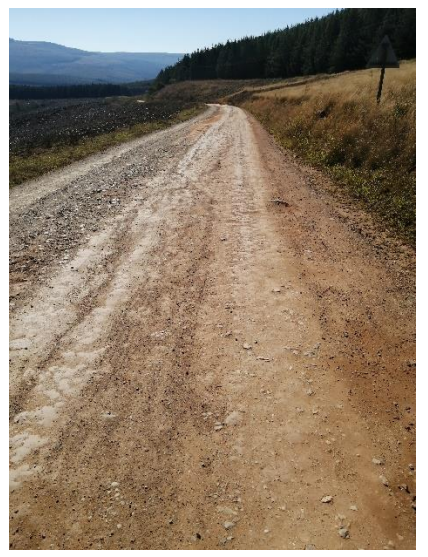
D221 road conditions and quarry