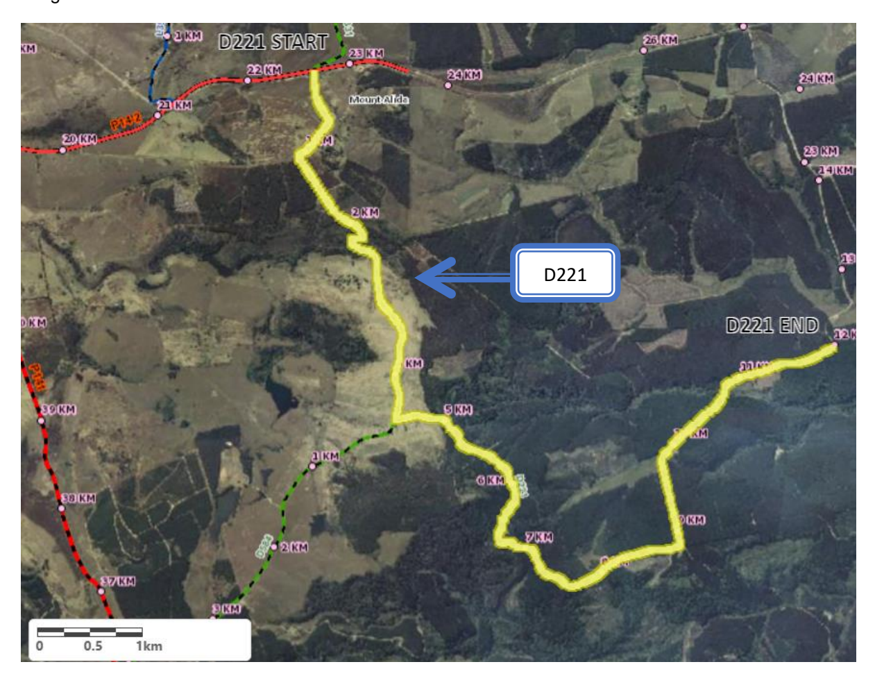
Figure C4.1 - Locality Plan of District Road 221

District Road 221 is located to the far North West of the New Hannover area. Access to this road can be achieved by travelling on the N3 towards Harrismith and taking the Mooi River and Bruntville turn off. After taking the turn off get onto P1-7/R103 and travel for 1 KM towards Mooi River. After travelling for 1 KM turn onto P14-1/R622 and then travel for 16 KM. After this the road will turn into P14-2 and continue this road for another 23 KM before reaching the D221 turn off. The location of the road can be seen in figure C4.1.